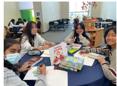
Turkey literature tasting