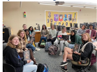
DNHS Book Club