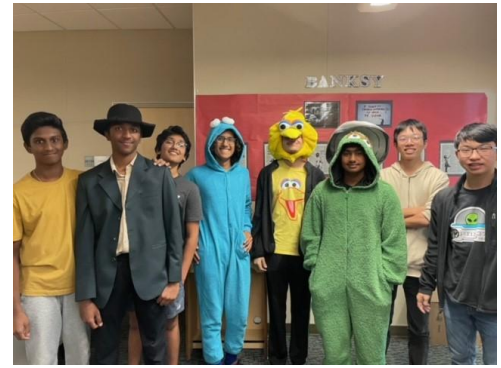
Short Story writing club

Thank you so much to all our Foundation donors as well as to our parent volunteers.